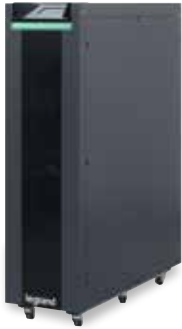
KEOR T EVO 10-15-20

Conventional UPS - Three-phase On-line double conversion VFI